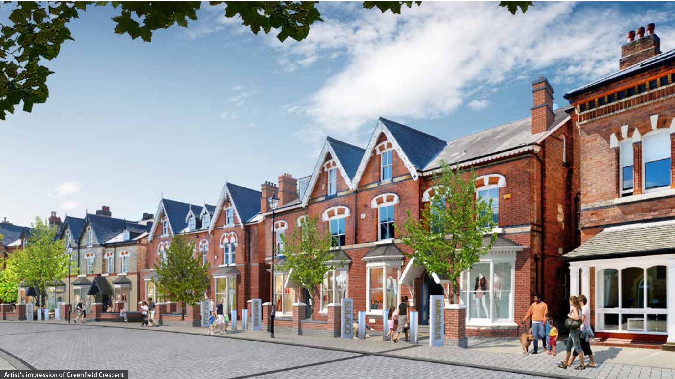
Artist's impression of Greenfield Crescent

EV Edgbaston Village A CALTHORPE COMMUNITY