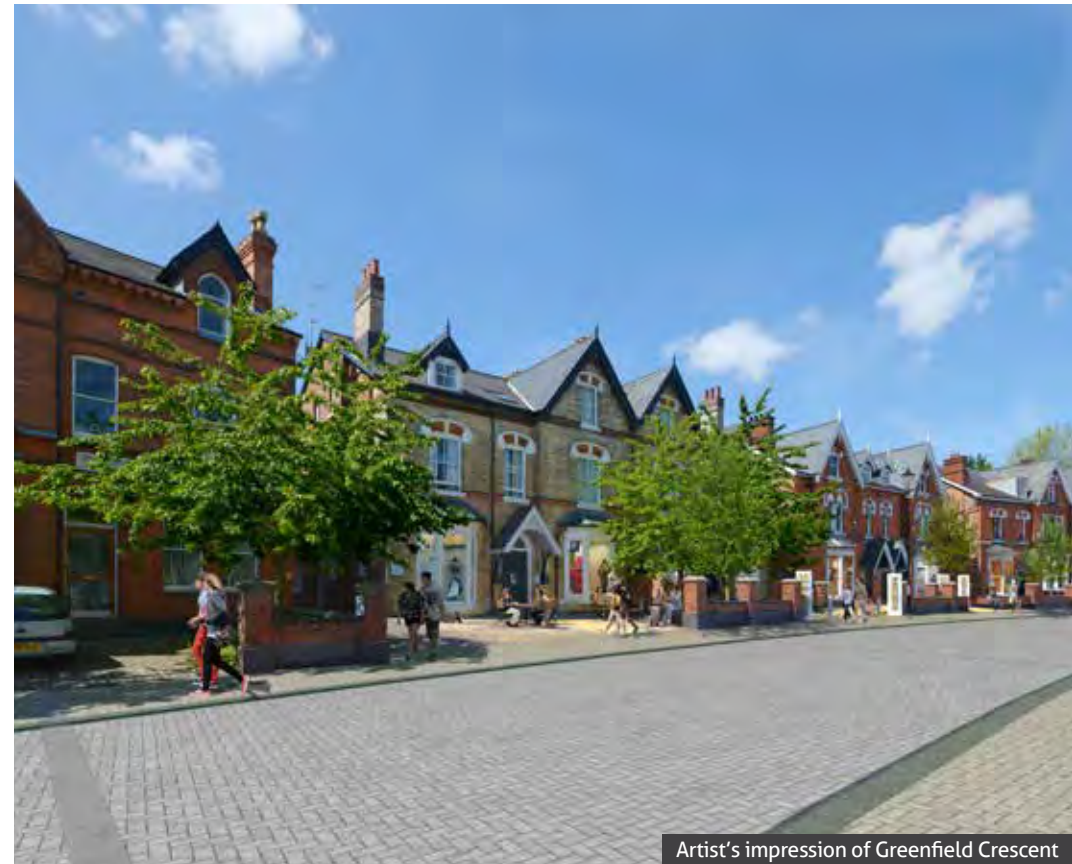
Artist's impression of Greenfield Crescent